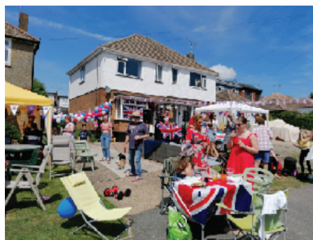
The Residents of Fairfield Rise (above/above right) had a great day on the 2nd June with a bouncy castle, hat and cake competitions, scavenger hunt, tin can alley, hopscotch, mini scooter races and much more. Lovely to have a fun traffic free environment bringing the community together.