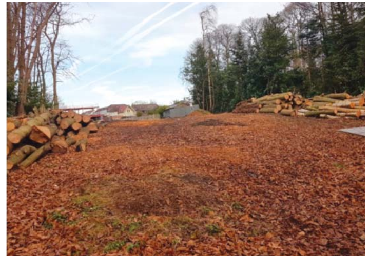
This photograph of "Woodchips and Sky" was taken from Norsey Wood's Main Ride looking up the garden towards Norsey Road. The definition of Ancient woodland is that it has been in continuous existence since 1600.

This has recently occurred on a property along the Norsey Road towards the Deerbank end. Just less than half an acre of semi-mature Sweet Chestnut trees were felled in the garden where it extends down to Norsey Wood's Main Ride. These trees will not be growing back as they would be in a coppiced situation. The Billericay Tree Wardens (BTW) has been liaising with the Norsey Wood Society (NWS), the Basildon Borough Council's Enforcement Officers (BBC) and our proactive environmentally aware town Councillor to question the legality of the tree loss. Legal searches have shown that the land was sold between two private individuals back in 1943.